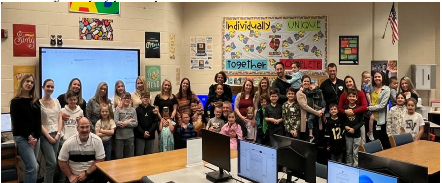
DVMS STAFF & CHILDREN

SPECIAL GUESTS IN THE HOUSE: Take Your Child to Work Day was celebrated on April 25, 2024. This traditionally has been a favorite day for our staff. We were able to have 24 guests attend a fun-filled day in the building. A nice chicken tender, mac & cheese, and cookie luncheon was prepared by the students in the Delaware Valley High School's Warrior Cafe. From all the observed smiles, the children and our staff genuinely enjoyed the day!