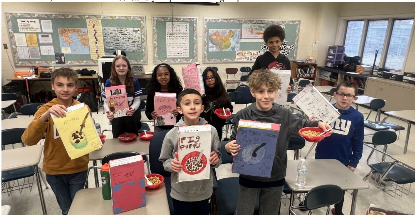
Mrs. Santucci's ELA 6 class

THINKING OUTSIDE THE BOX: Over the past month, the students in Mrs. Santucci's ELA 6 class read the novel Fig Pudding by Ralph Fletcher . They completed reading logs, participated in literature review circles, and applied newly acquired reading comprehension strategies. They then created Cereal Box Book Reports which required them to invent a new cereal, design its box meeting specific requirements, and deliver a marketing presentation – all around the central theme of Fig Pudding . The novel study concluded with a cereal celebration in the classroom. From distinguished readers to cereal connoisseurs, Mrs. Santucci is cereal-sly so proud of this group!